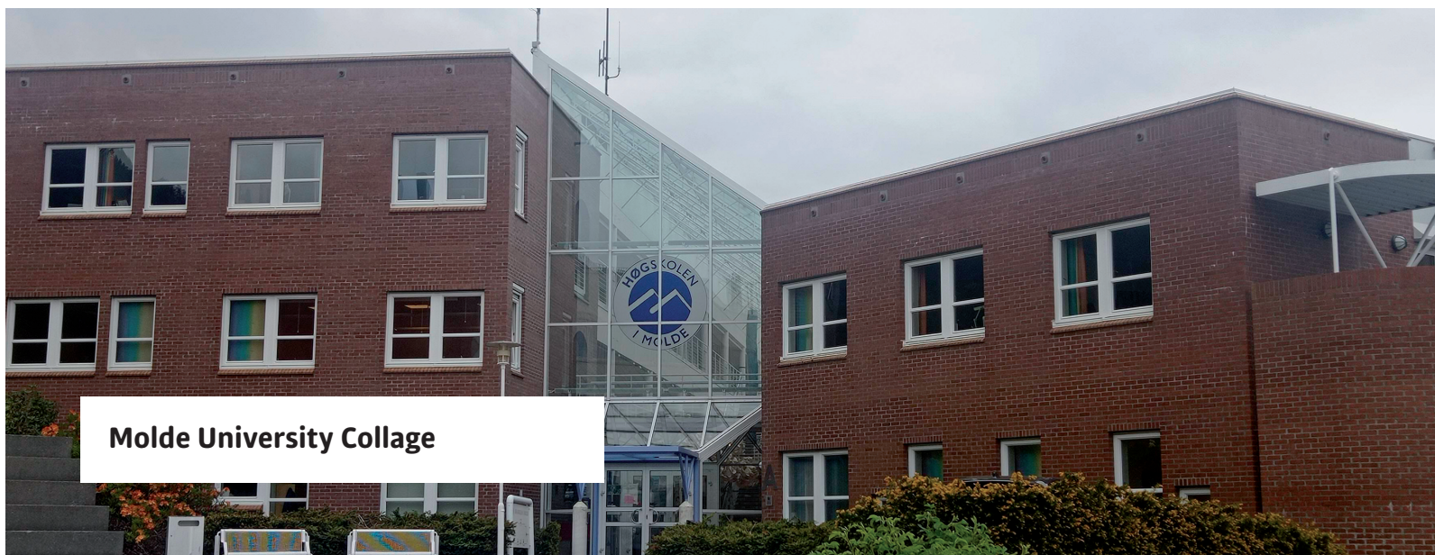
Molde University Collage

The training mobility in the form of the so-called job-shadowing with the possibility to converse with the university staff was an excellent opportunity for me to put my skills (e.g. language skills) and competences to the test that I make use of in my everyday duties and tasks. The three-day stay in Molde was a unique opportunity to experience and appreciate the natural qualities, elements of the cultural heritage of the city and the country, approaches to ecological solutions, e.g. in public transport, and use of IT solutions in many areas of economic and social life in Norway.